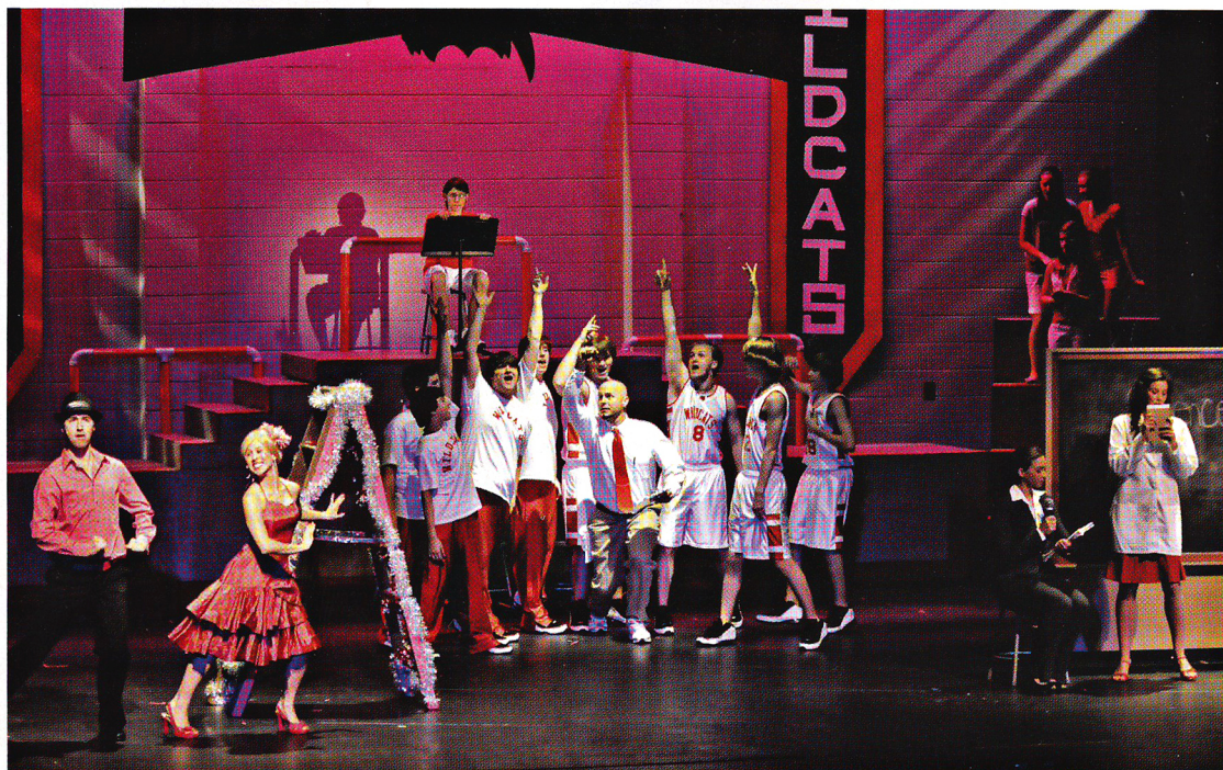
IN THE SPOTLIGHT: Ryan and Sharpy (left) audition for the high school musical while the Wildcat basketball team (center) plays a key game and Gabriella (right) competes in the science decathlon.